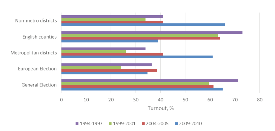
Figure 2: Election turnout, selected types

Where multiple elections took place within the period, the median was chosen.